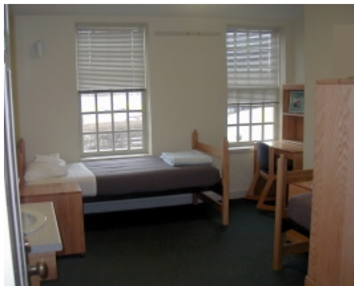
A recently renovated Ebert Hall dormitory room awaits its summer residents.