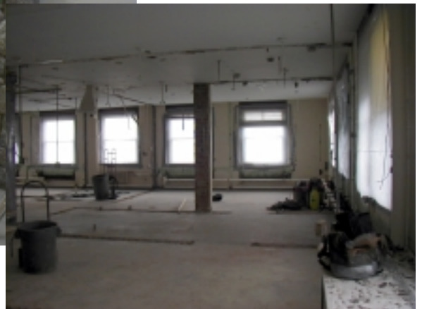
The third floor of the Lillie Building is being renovated to provide lab space for the new Global Infectious Diseases Program.