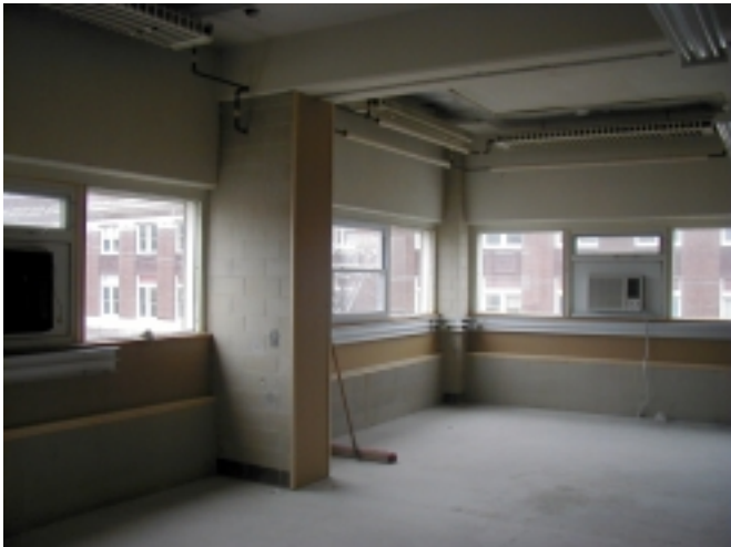
The Grass Lab's new space, on the third floor of the Whitman Building, overlooks the Lillie Building and MBL Street.

Last October, the MBL began reconfiguring 1,400 square feet of laboratory space on Whitman's third floor. It is one of several renovations currently underway at the laboratory (see page 2). The area formerly housed a number of summer educational activities, including SPINES (Summer Program in Neuroscience, Ethics, & Survival) and a program for undergraduates from Williams College funded by the Howard Hughes Medical Institute. These programs are moving to the Loeb Building, which now houses most of the MBL's educational programs.