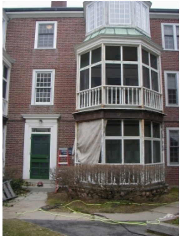
Porch structural repairs to the Brick Apartment Building.

Human Resources, Education, Research Space Administration, Financial Services, and the Biological Bulletin staff will move into a renovated Homestead Building this spring.